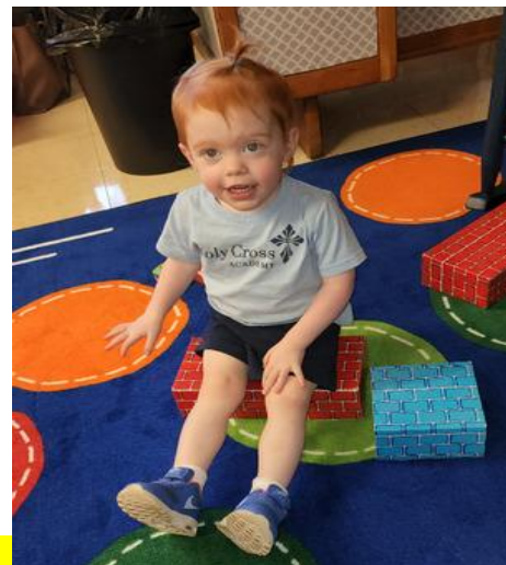
Holy Cross Academy Early Childhood Education Campus August 26, 2022