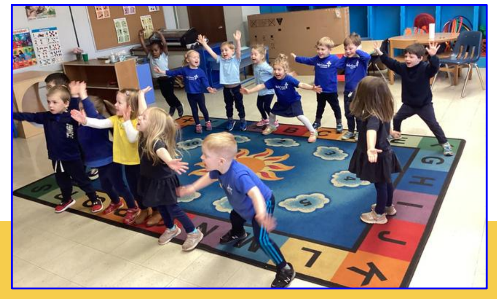
Excited to Share ECEC News for January 27, 2023