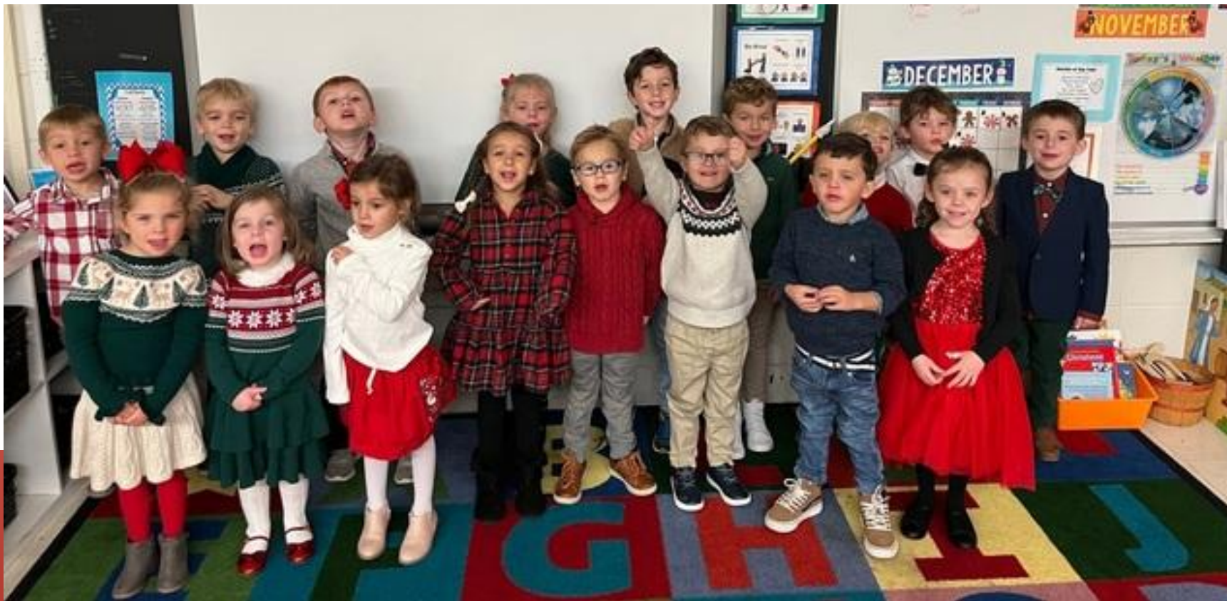
Third Week of Advent ECEC News Dec. 16, 2022