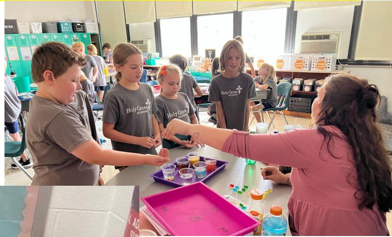
4th Grade Experiments with Gummy Bears in Science