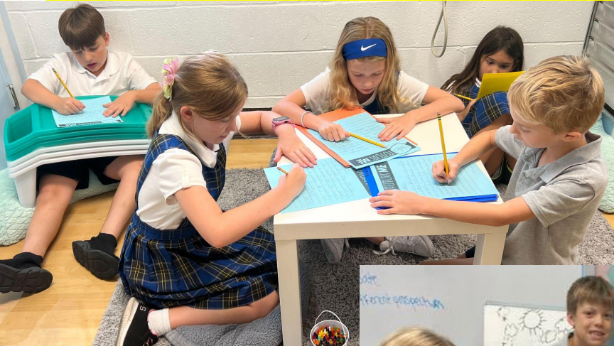
3rd Grade Works in the Cozy Corner