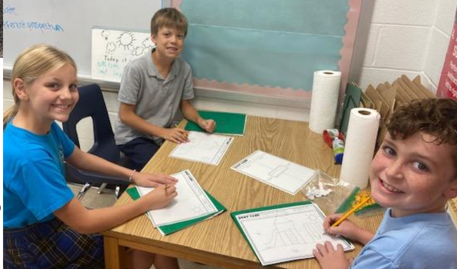
5th Grade Does Group Work in Book Club