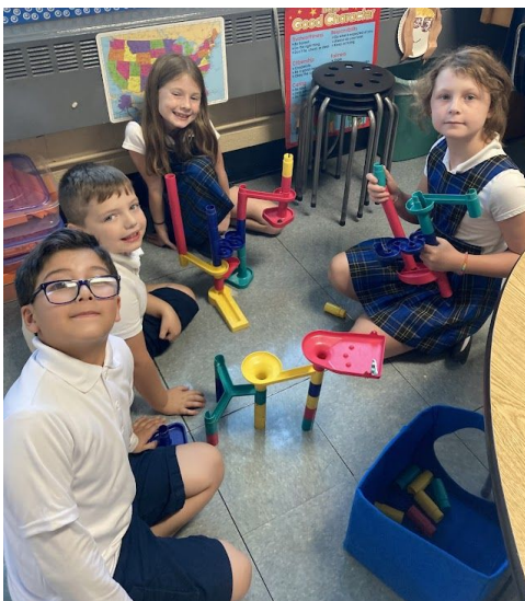
Second grade Science fun!